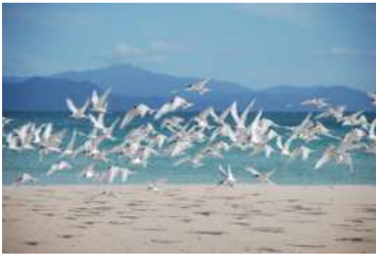
'Flight' Alison Farrar Print - B Grade