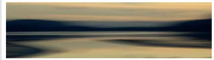
McCree Landscape Cup