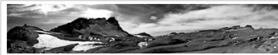
Chambers Landscape Trophy