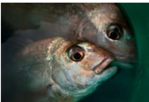
'Catch of the Day' Shona Kebble