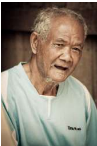
A Village Elder

The villagers were very friendly and accommodating.