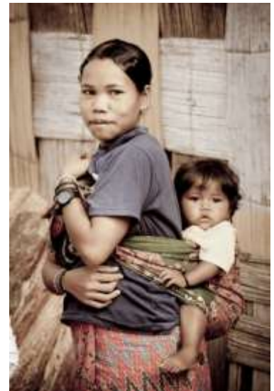
Some mothers were as young as fourteen

All I got to see of the elephants was Dung!