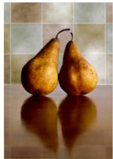
'A Right Pair'